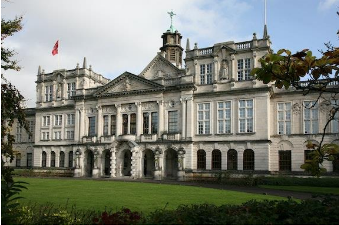
Main Building – Museum Avenue frontage

The Main Building is located between Park Place and Museum Avenue. It is opposite the Centre for Student Life on Park Place and Alexandra Gardens on Museum Avenue.