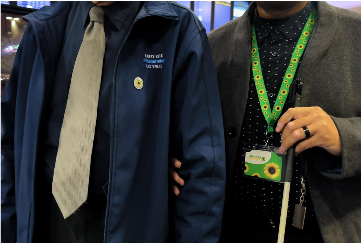
A Harry Reid International Airport employee assists a traveler wearing a Hidden Disabilities Sunflower lanyard.