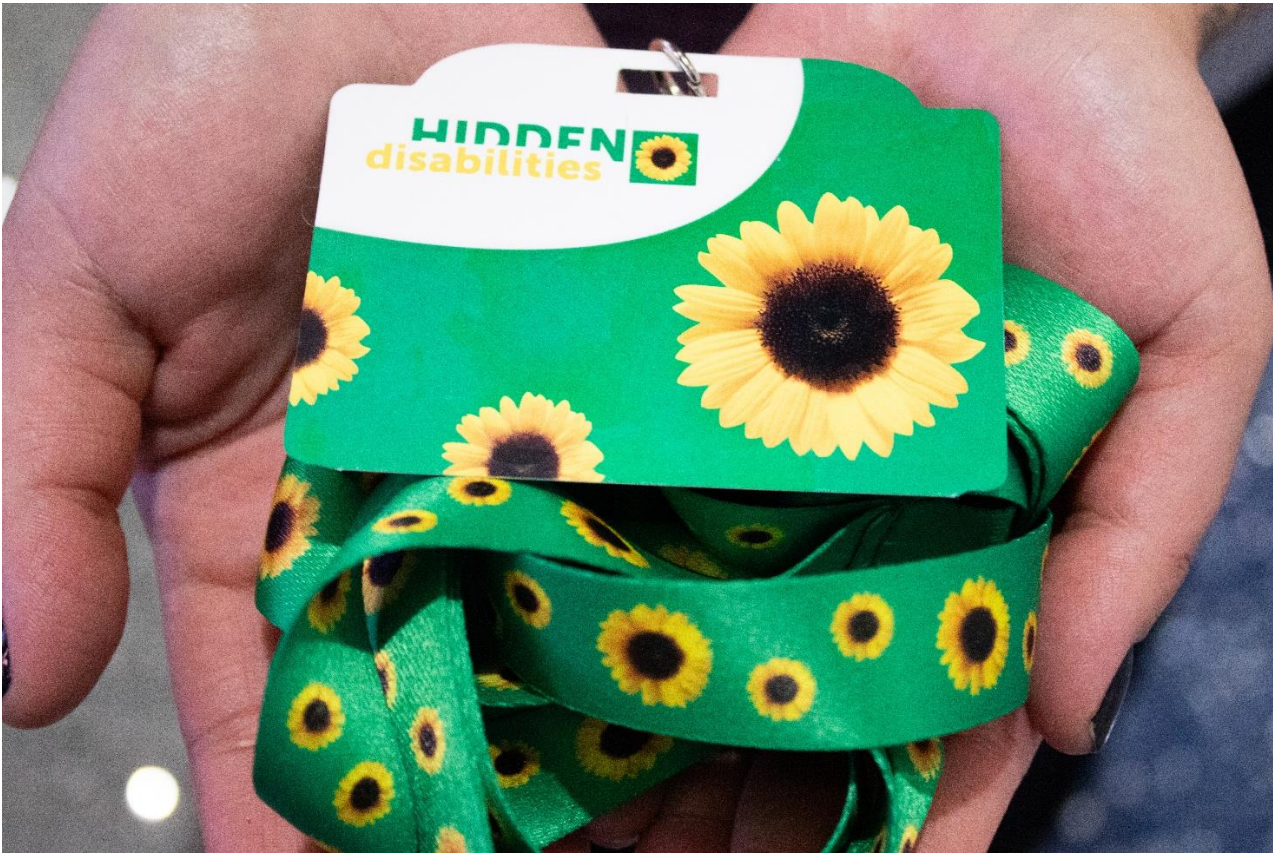
The Hidden Disabilities Sunflower lanyard is a discreet way to indicate that someone may have a non-visible disability and could benefit from additional assistance or time.