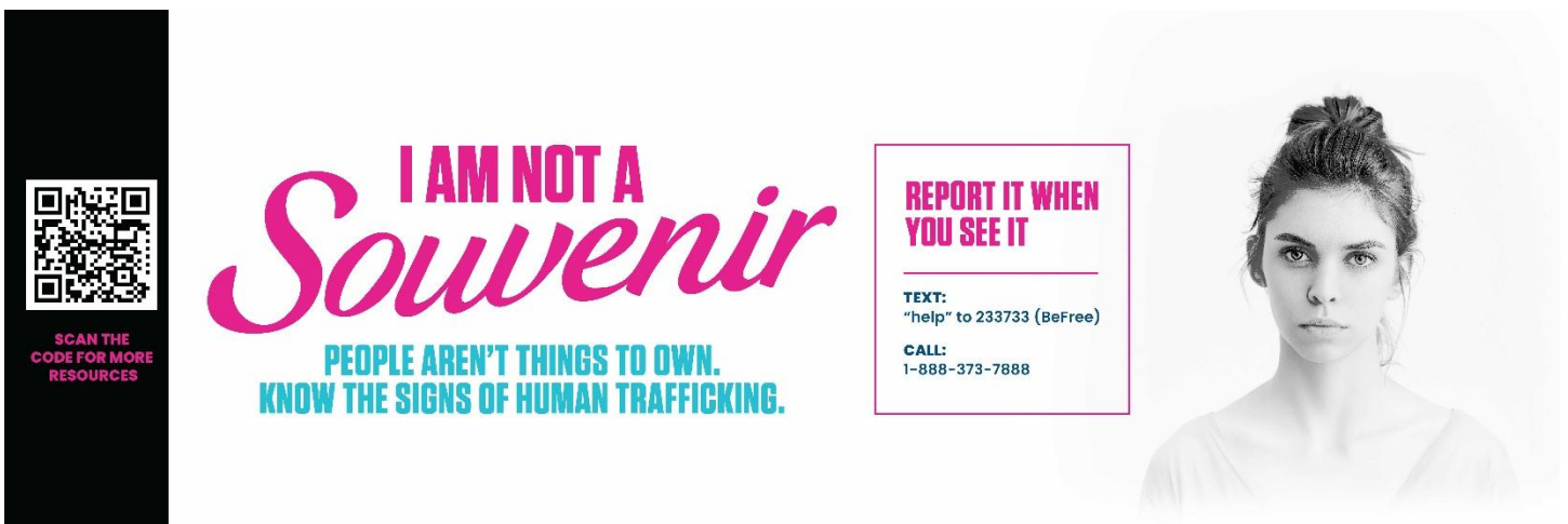
I Am Not A Souvenir Campaign graphic at Harry Reid International Airport.