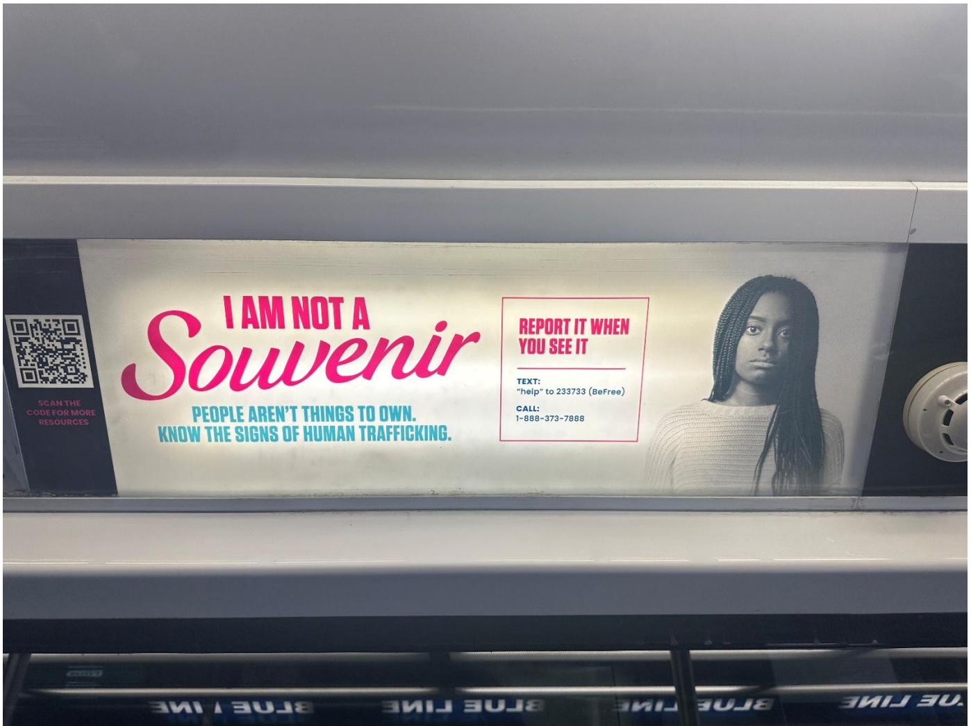
I Am Not A Souvenir Campaign sign within inter-terminal tram car at Harry Reid International Airport.