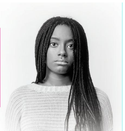
I Am Not A Souvenir Campaign graphic at Harry Reid International Airport.