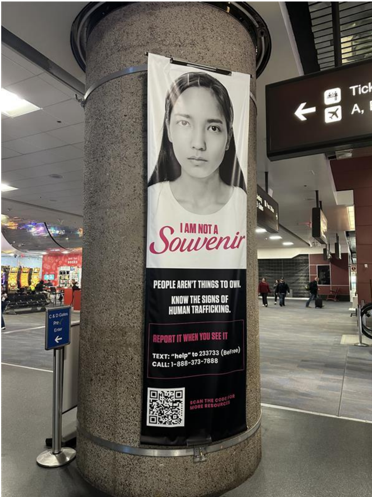
I Am Not A Souvenir Campaign sign within Terminal 1's Level 2 Esplanade at Harry Reid International Airport.