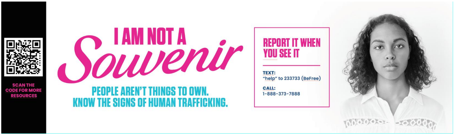
I Am Not A Souvenir Campaign graphic at Harry Reid International Airport.