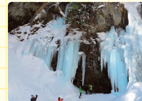
UNRYU VALLEY (ICE WORLD) TREKKING