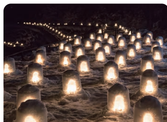
Yunishigawa Onsen Kamakura Snow House Festival