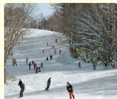
SNOWBOARDING, AND SKIING