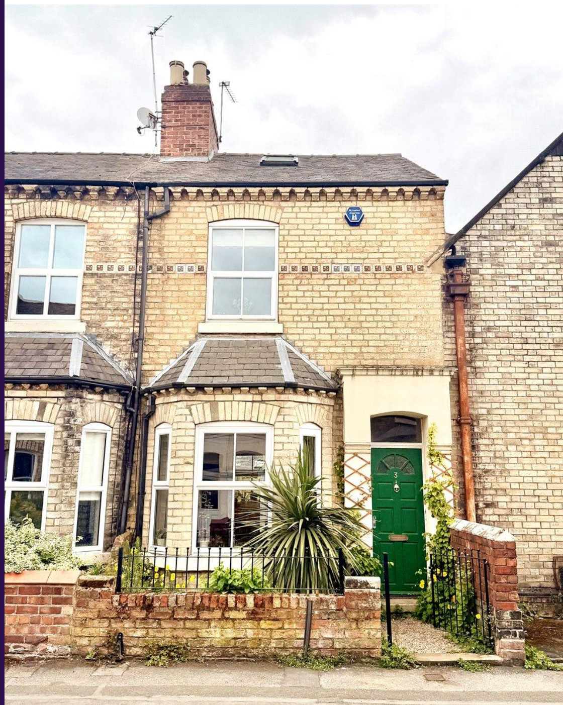
NEVILLE TERRACE, YORK £350,000