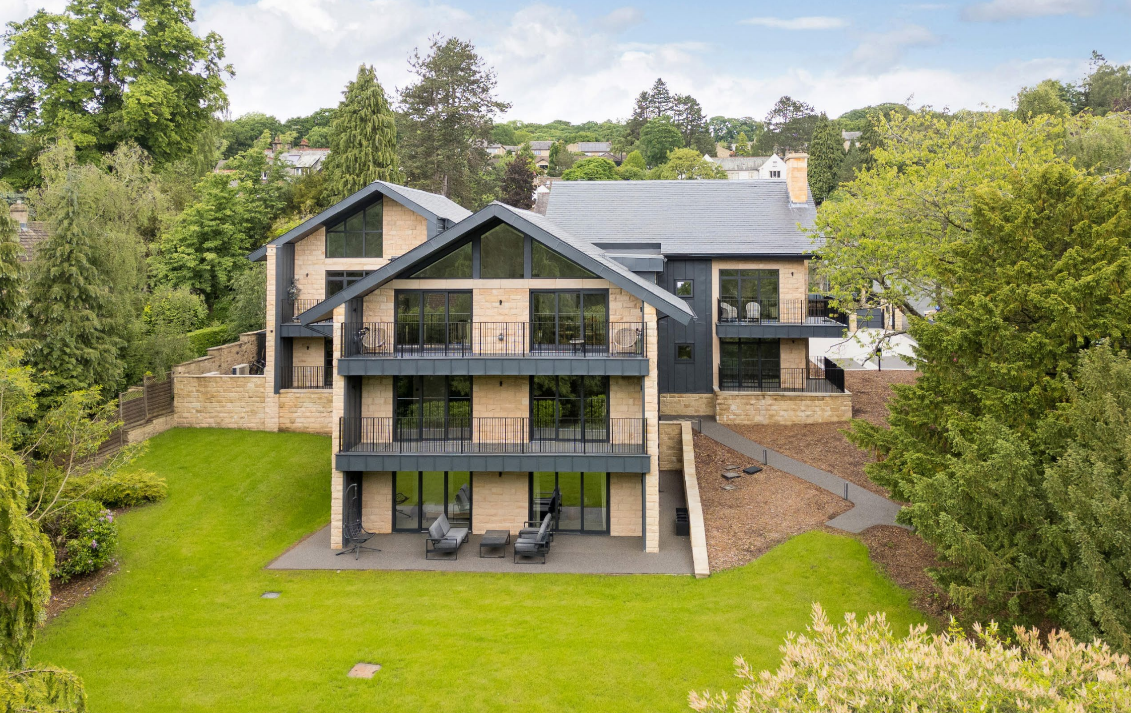
APARTMENT 3, ROBIN HILL Clifford Road, Ilkley