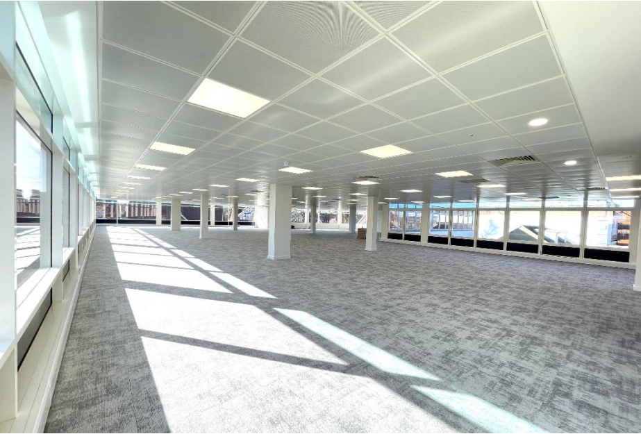
L2 - Business Data