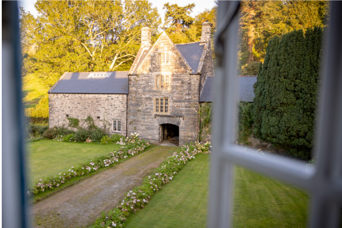
Glyn Cywarch Eryri To Let: £5,000pcm

Nestled within a secluded valley in the heart of Eryri lies Glyn Cywarch, a remarkable Grade I listed Jacobean manor that stands as one of Wales's architectural treasures.