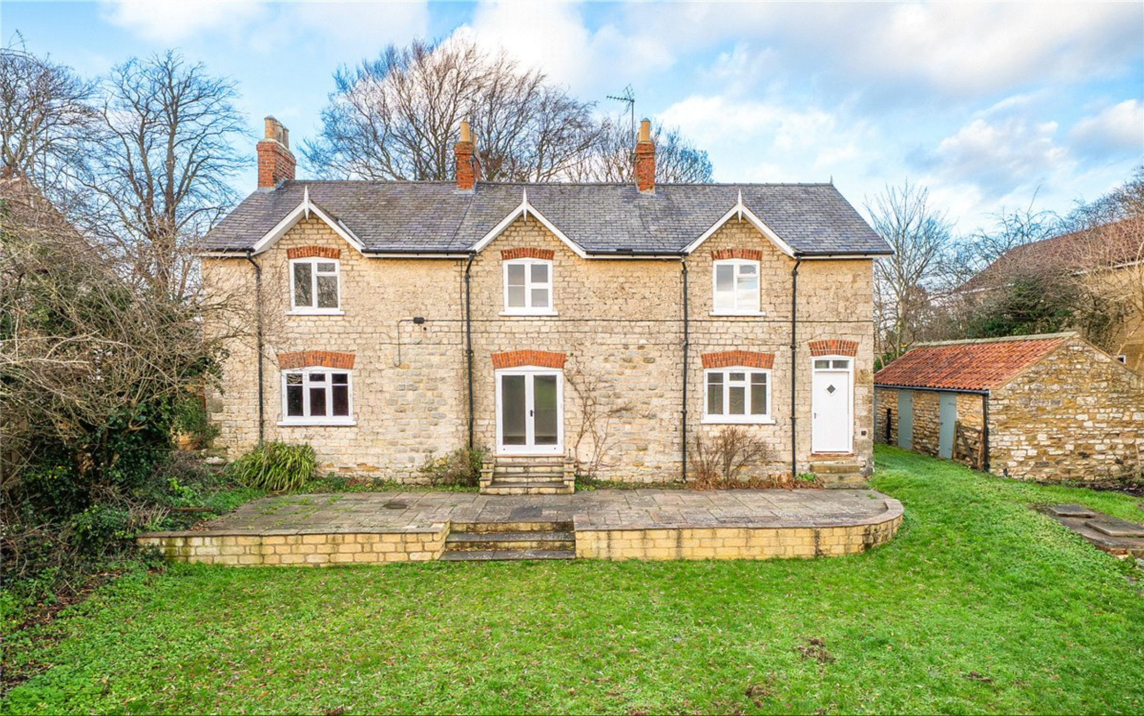
KIRKBECK HOUSE, LANGTON GUIDE PRICE £750,000