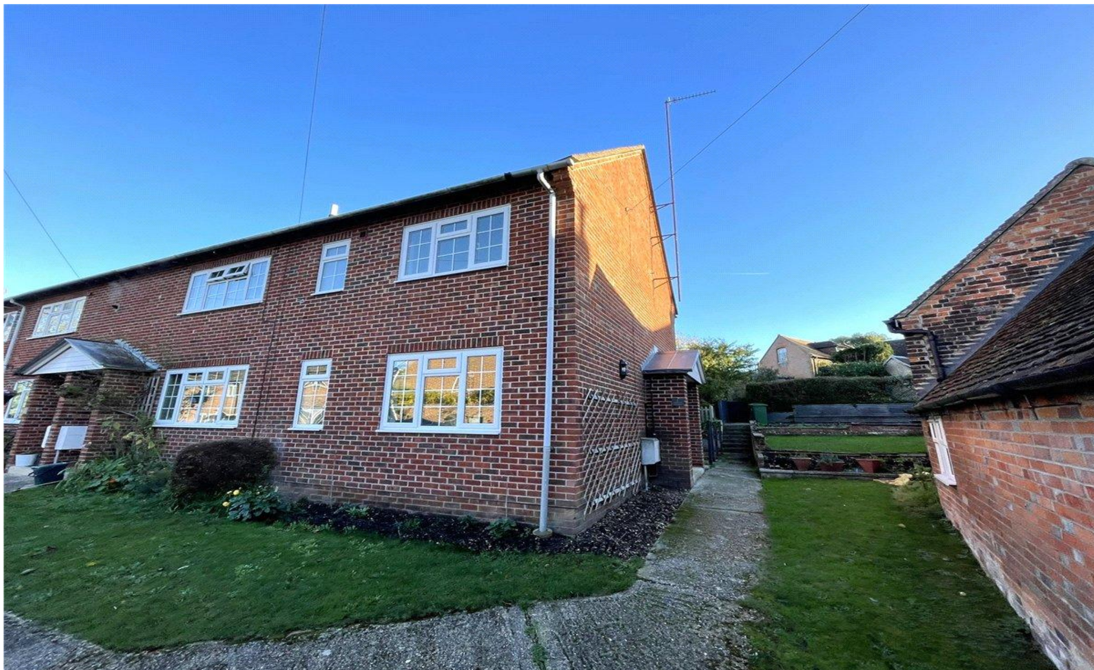
ALDWYCH COTTAGES, CASTLE LANE, RG14 £1,300 per month*