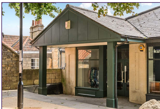
First floor rear access onto Broad Street Place.

All viewings should be made through the sole agents Carter Jonas 01225 747260.