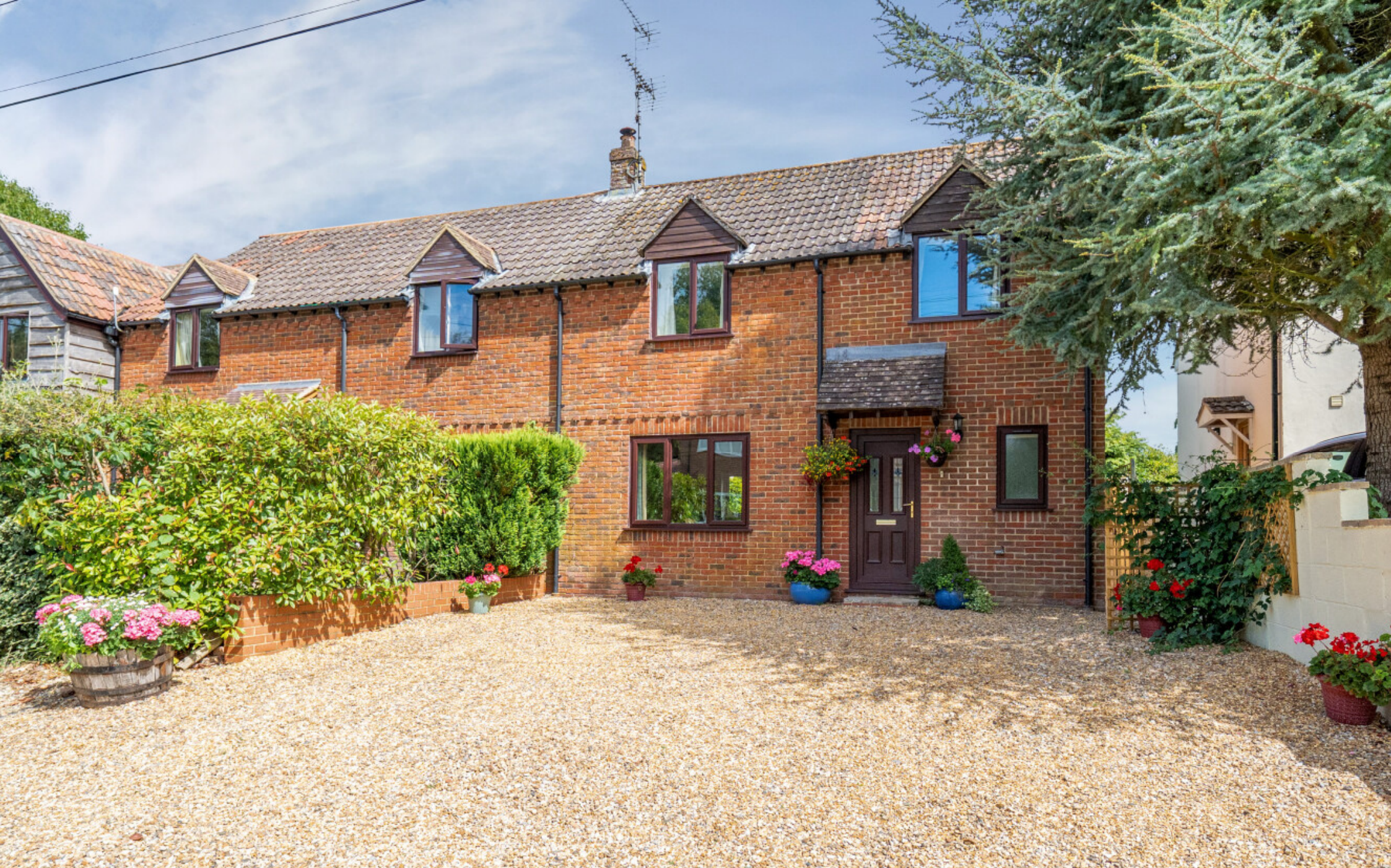
DROVE COTTAGE, YATESBURY