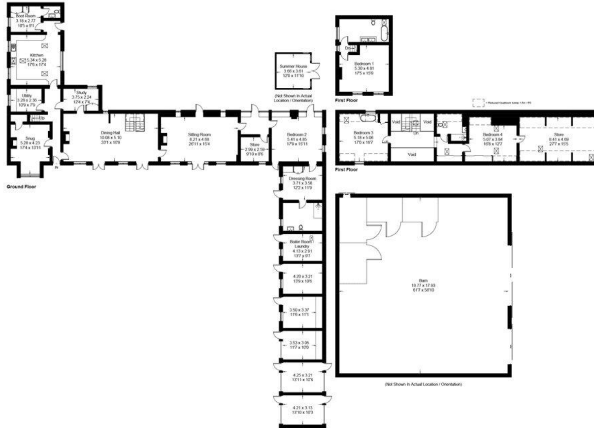
illustration for identification purposes only. measurements are approximate, not to scale Pursuant to RICS Property Measurement 2nd Edition © Intelligent Property Marketing 2026