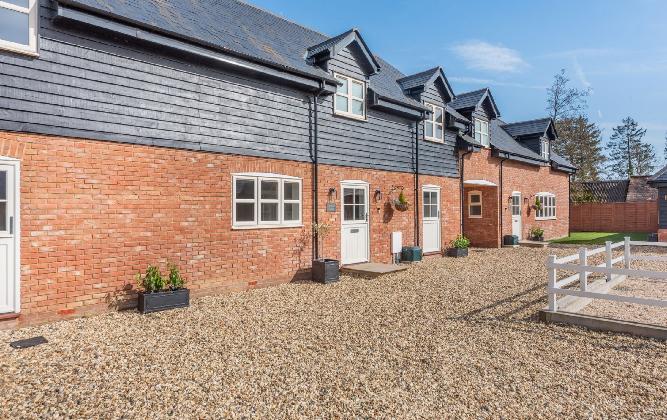
LAVENDER COTTAGE Guide Price £525,000