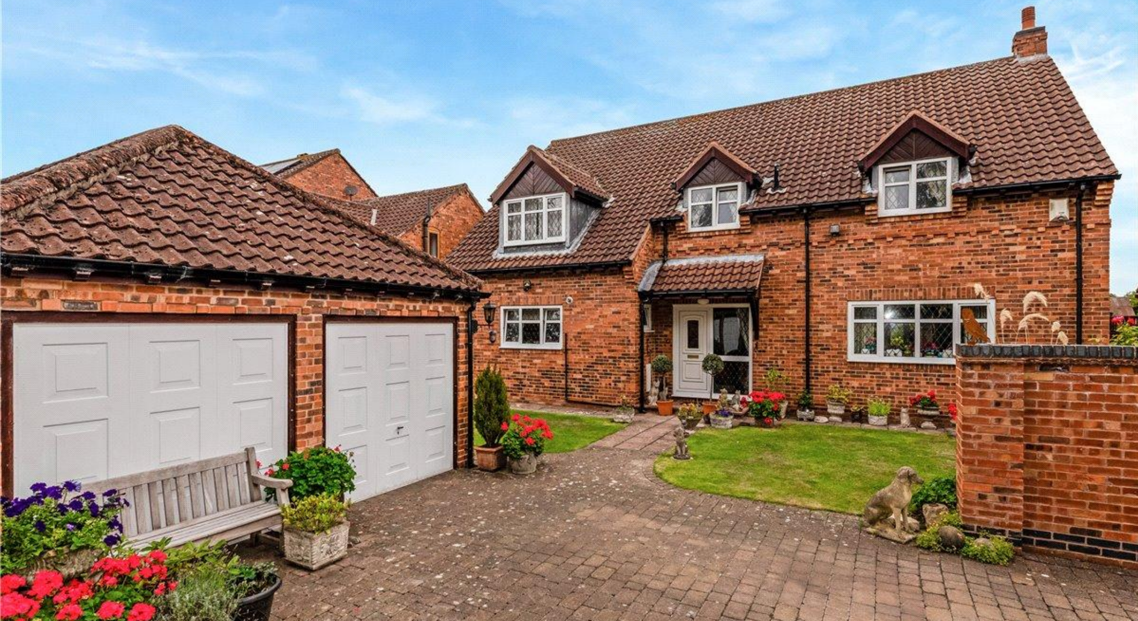
BYFIELD HOUSE, YEW TREE CLOSE, ACASTER MALBIS £725,000