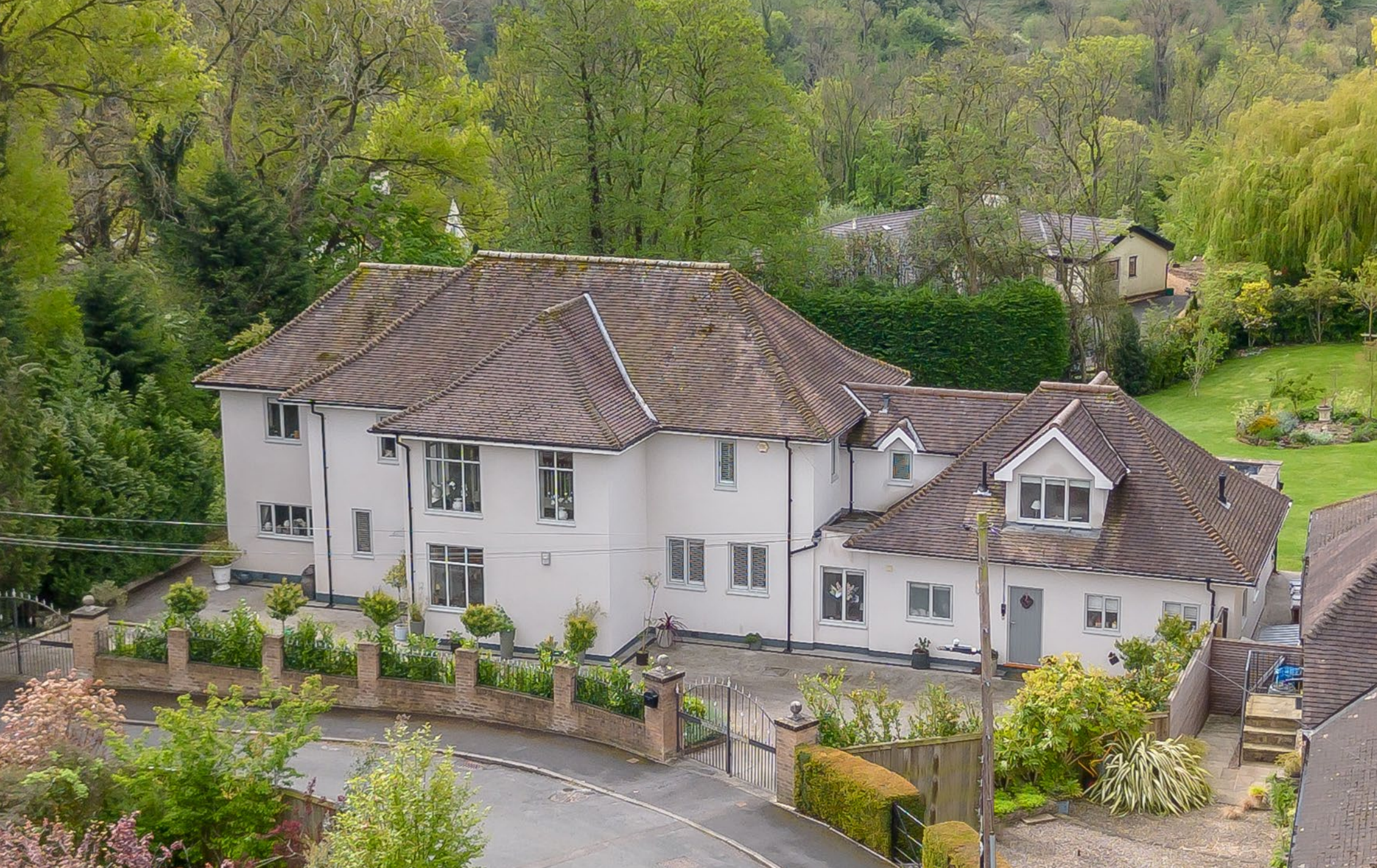
WINDRUSH HOUSE Fortune Hill, Knaresborough