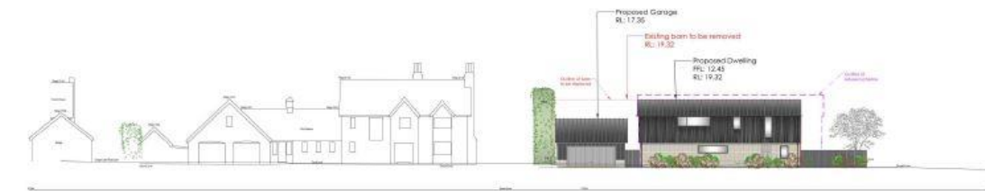
PROPOSED STREET SCENE Scale 1:200