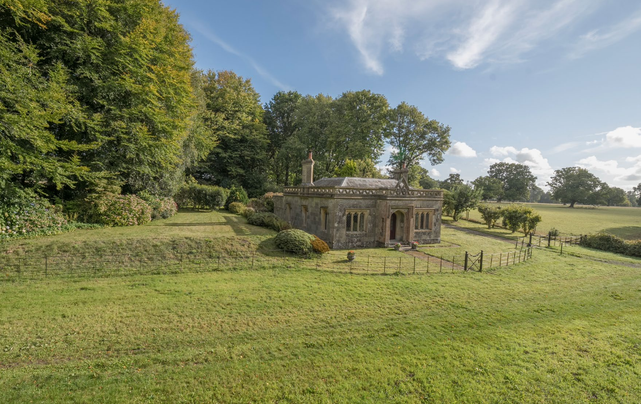
TERRACE LODGE Stourton