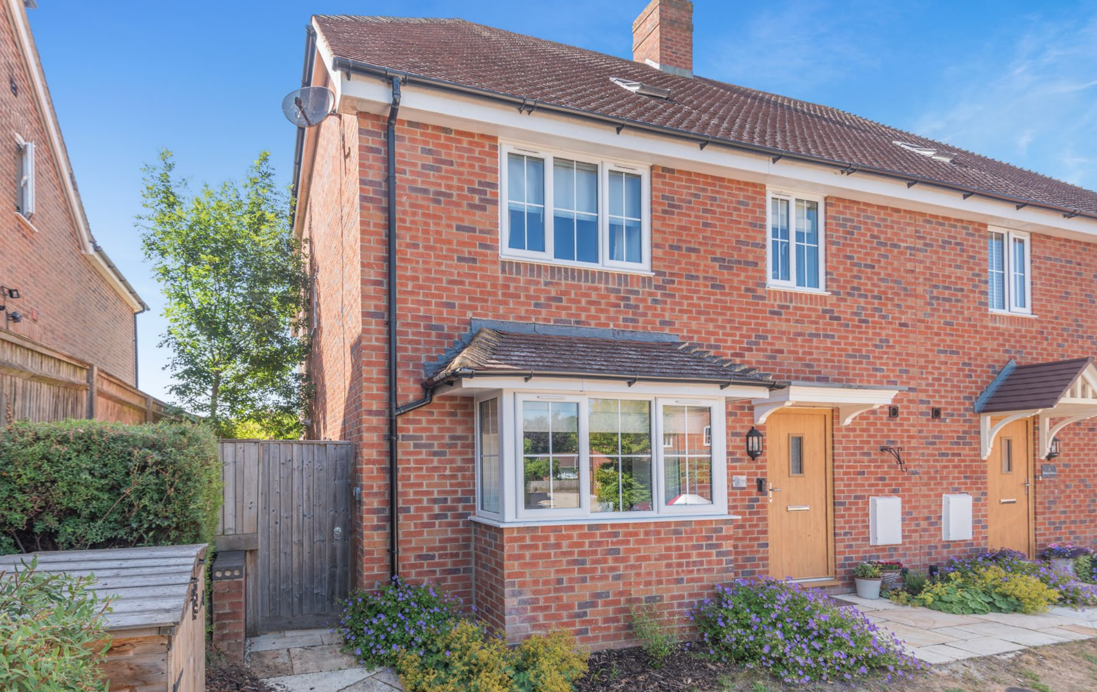
DEANERY HOUSE Guide Price £610,000