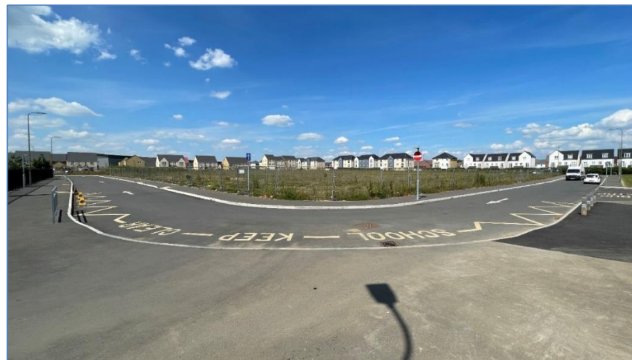
View from school entrance (from South corner towards North).