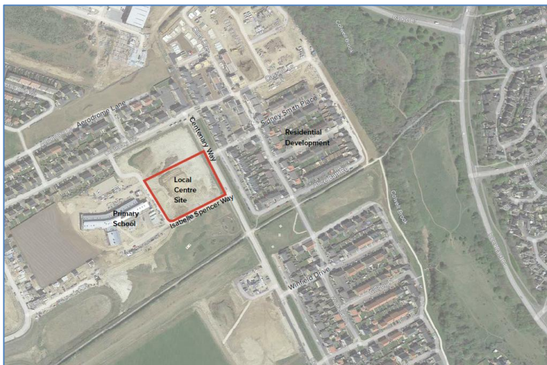
Aerial view (note: the view does not show latest developments)