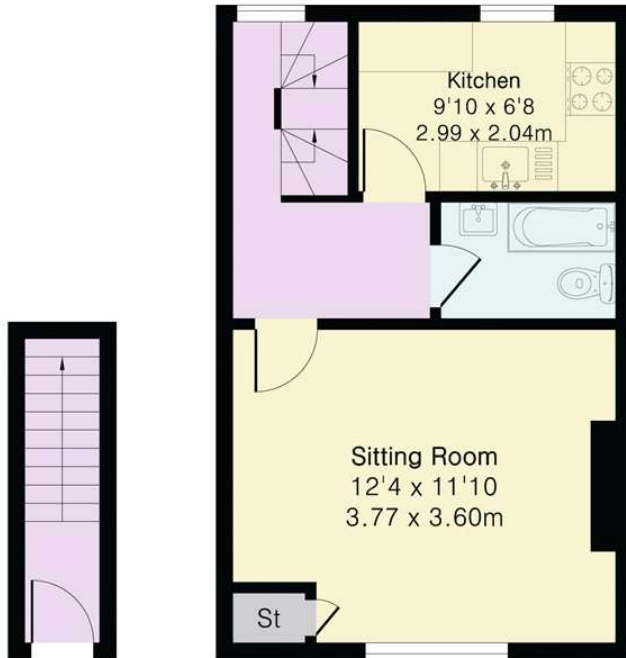
Ground Floor First Floor