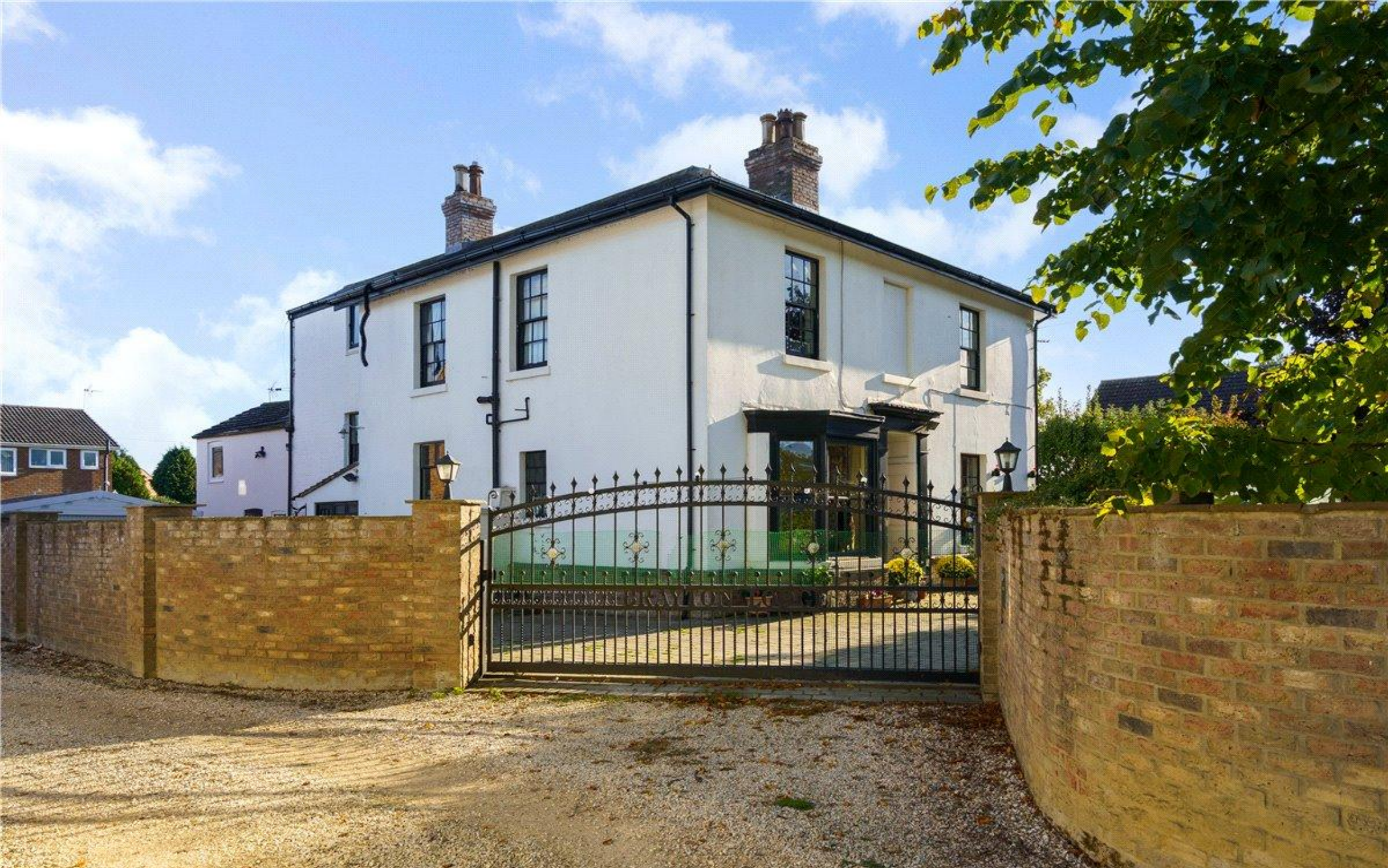
BRAYTON LODGE, DONCASTER ROAD, SELBY £725,000