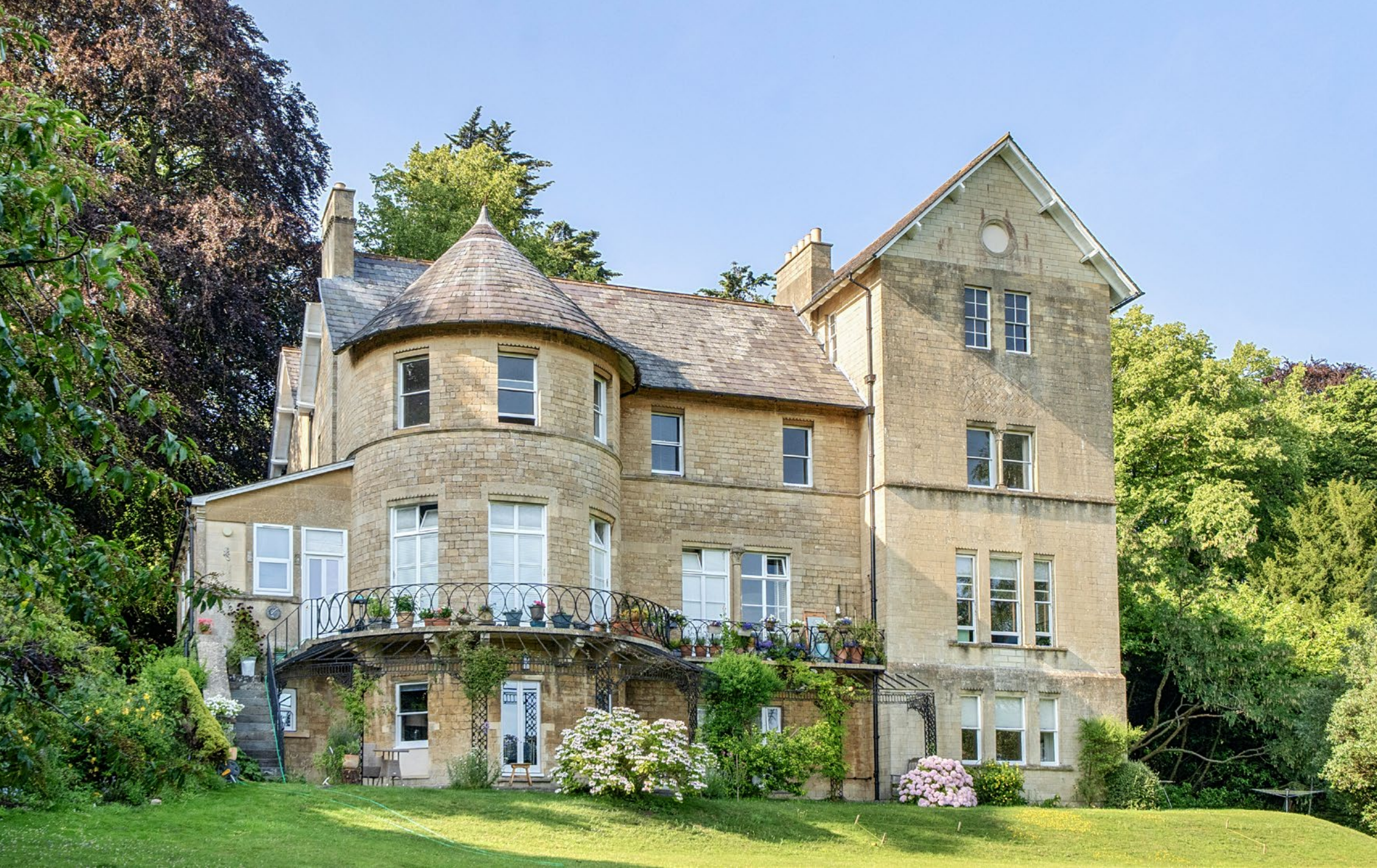
LAGGAN HOUSE College Road, Bath