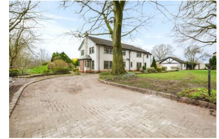
Mount Pleasant Cottage, Warrington

Total area: approx. 282.2 sq. metres (3038.0 sq. feet) This floor plan is for illustrative purposes only. It is not drawn to scale. Any measurements, floor areas (including any total floor area), coverings and orientation are approximate. No details are guaranteed, they cannot be relied upon for any purpose and they do not form part of any agreement. No liability is taken for any error, omission or misstatement. A party must rely upon its own inspection(s). Produced by Focus Pro Plan produced using iFingo.