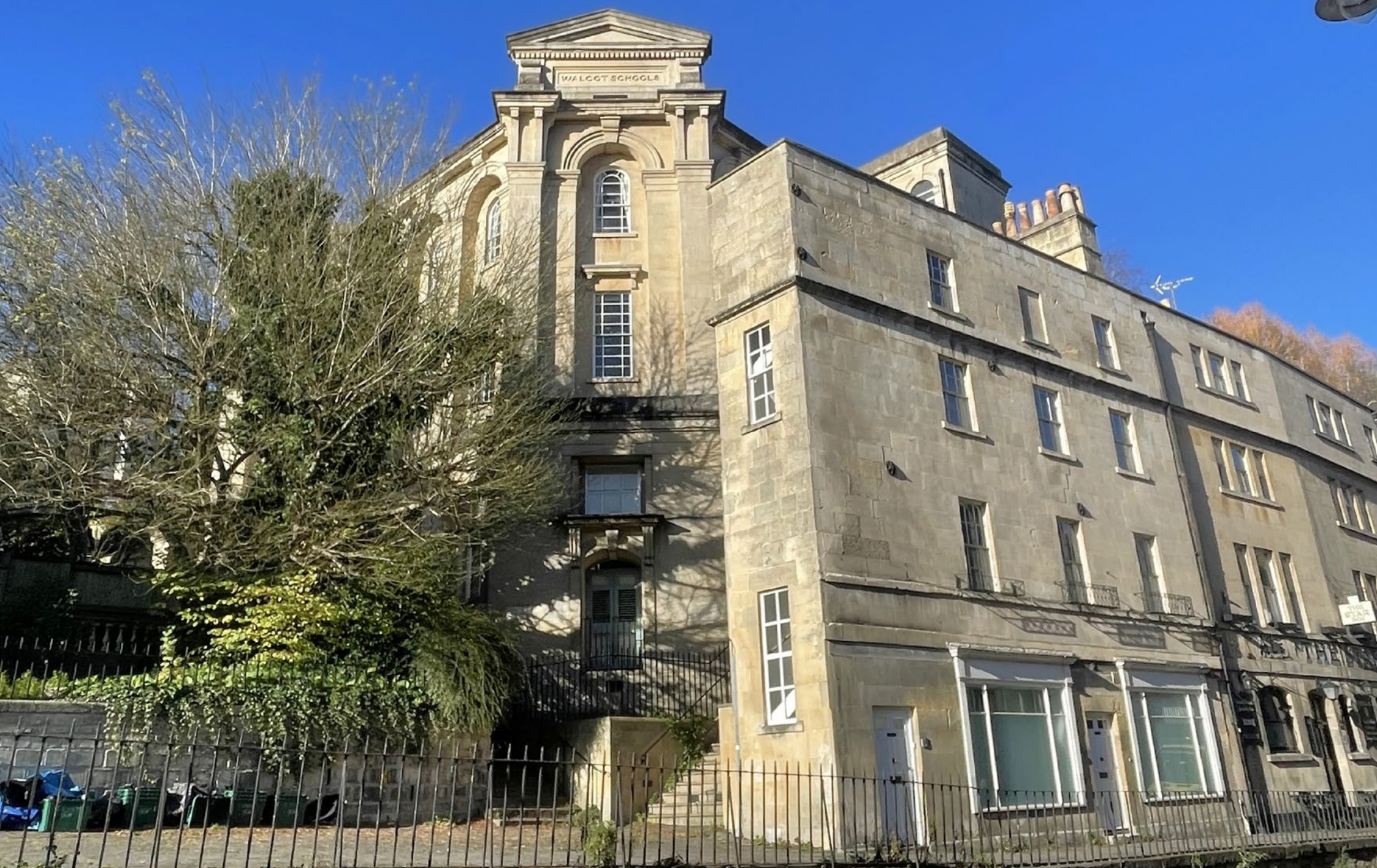
FLAT 1, 21 VINEYARDS Bath