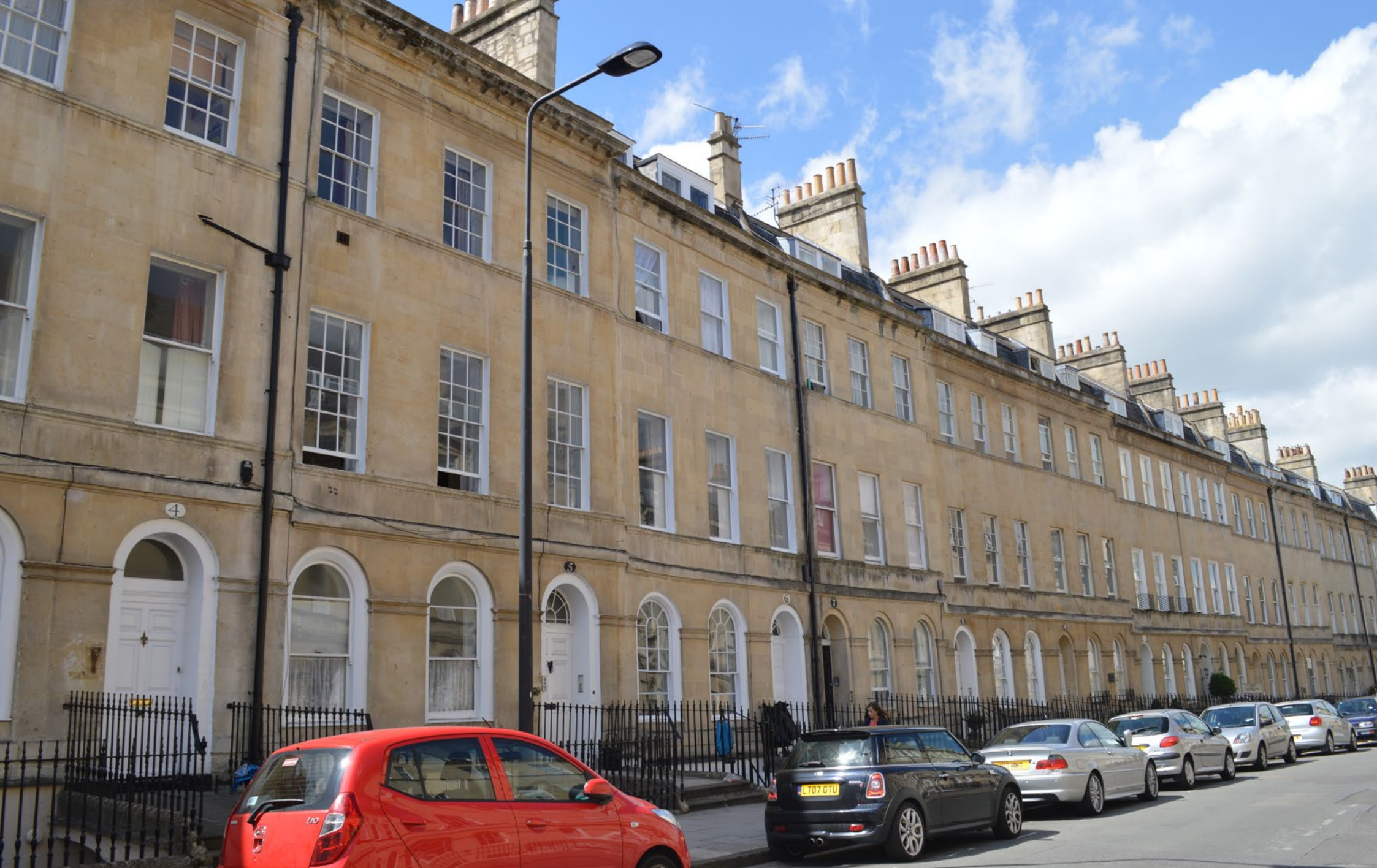
5 HENRIETTA STREET Bath