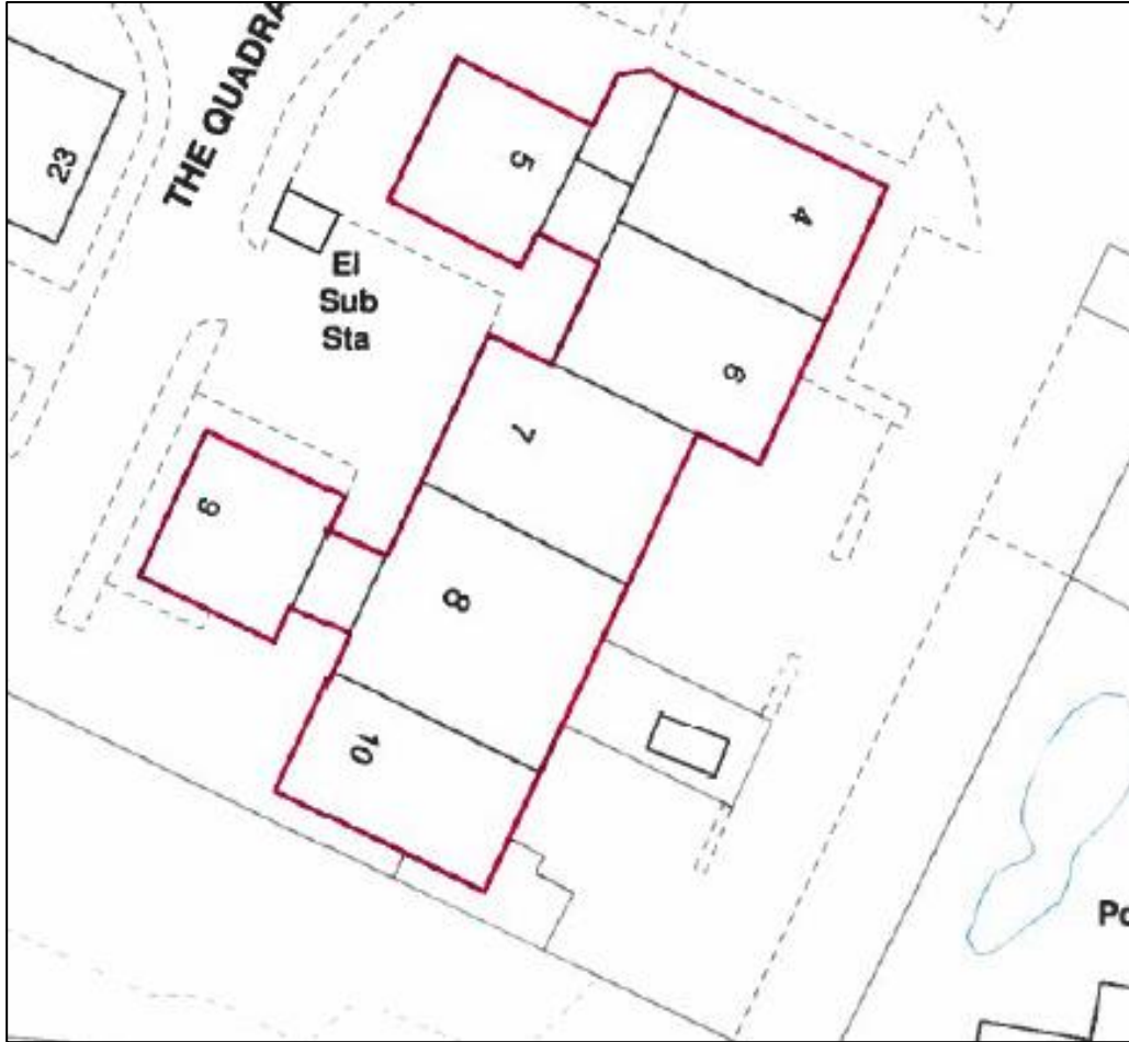
For context only, not to scale