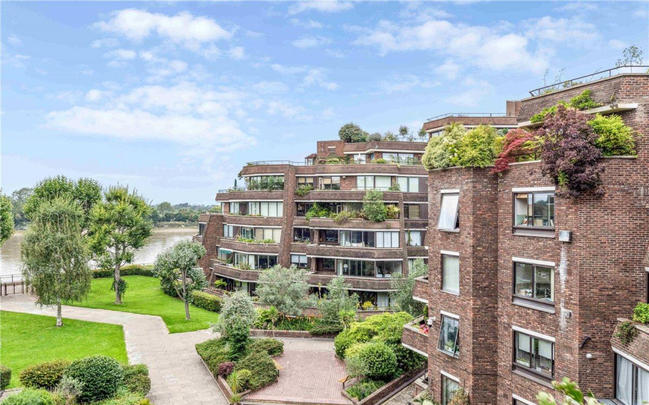
ALDER LODGE, 73 STEVENAGE ROAD, SW6 £750,000