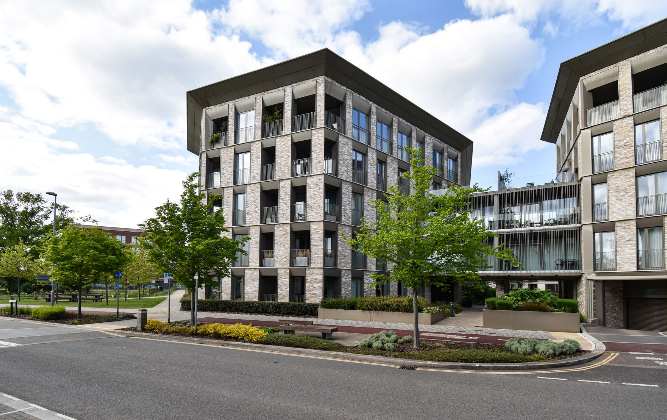
THE ASH BUILDING Rudduck Way