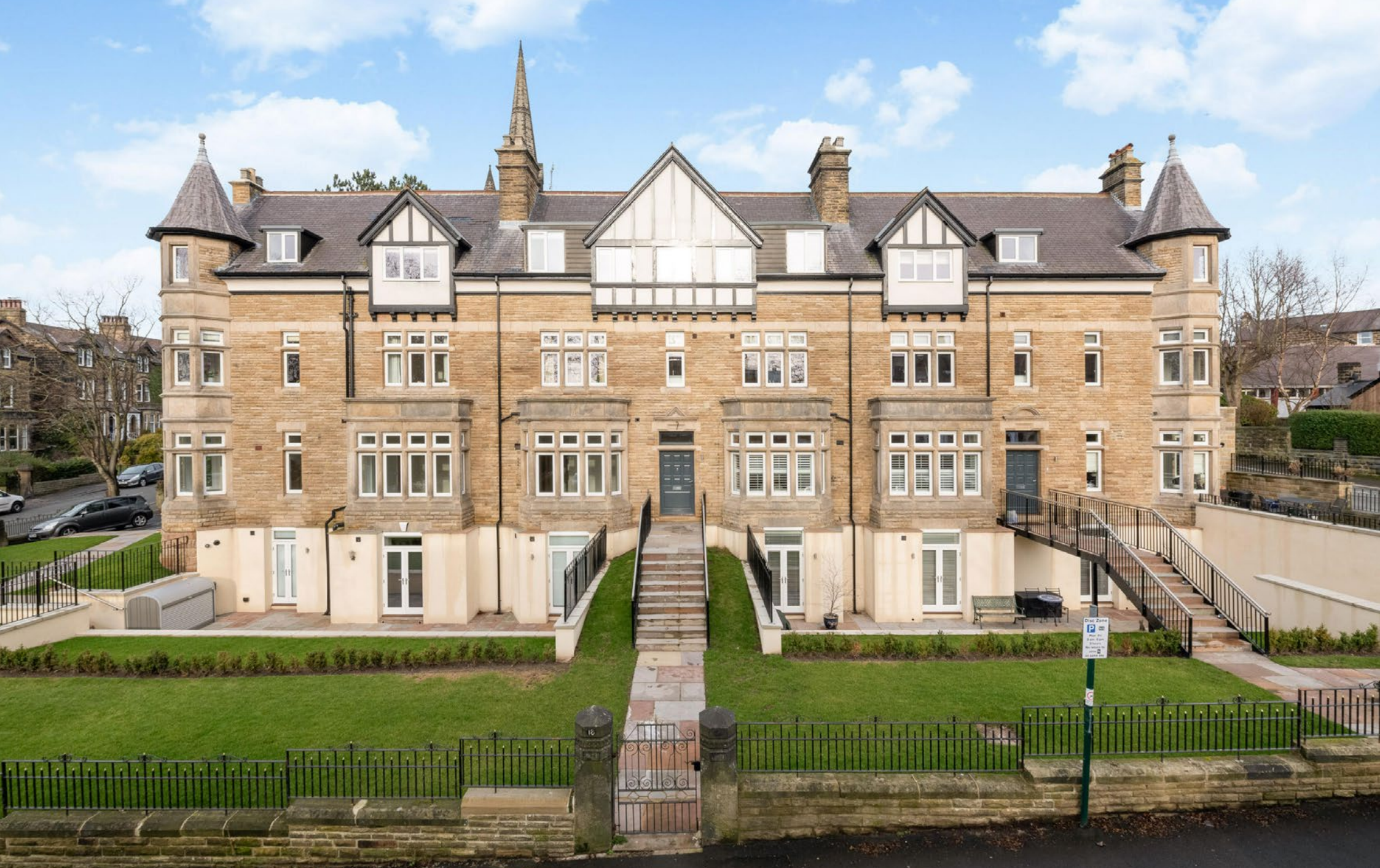
APARTMENT 5, THE BALMORAL Franklin Mount, Harrogate