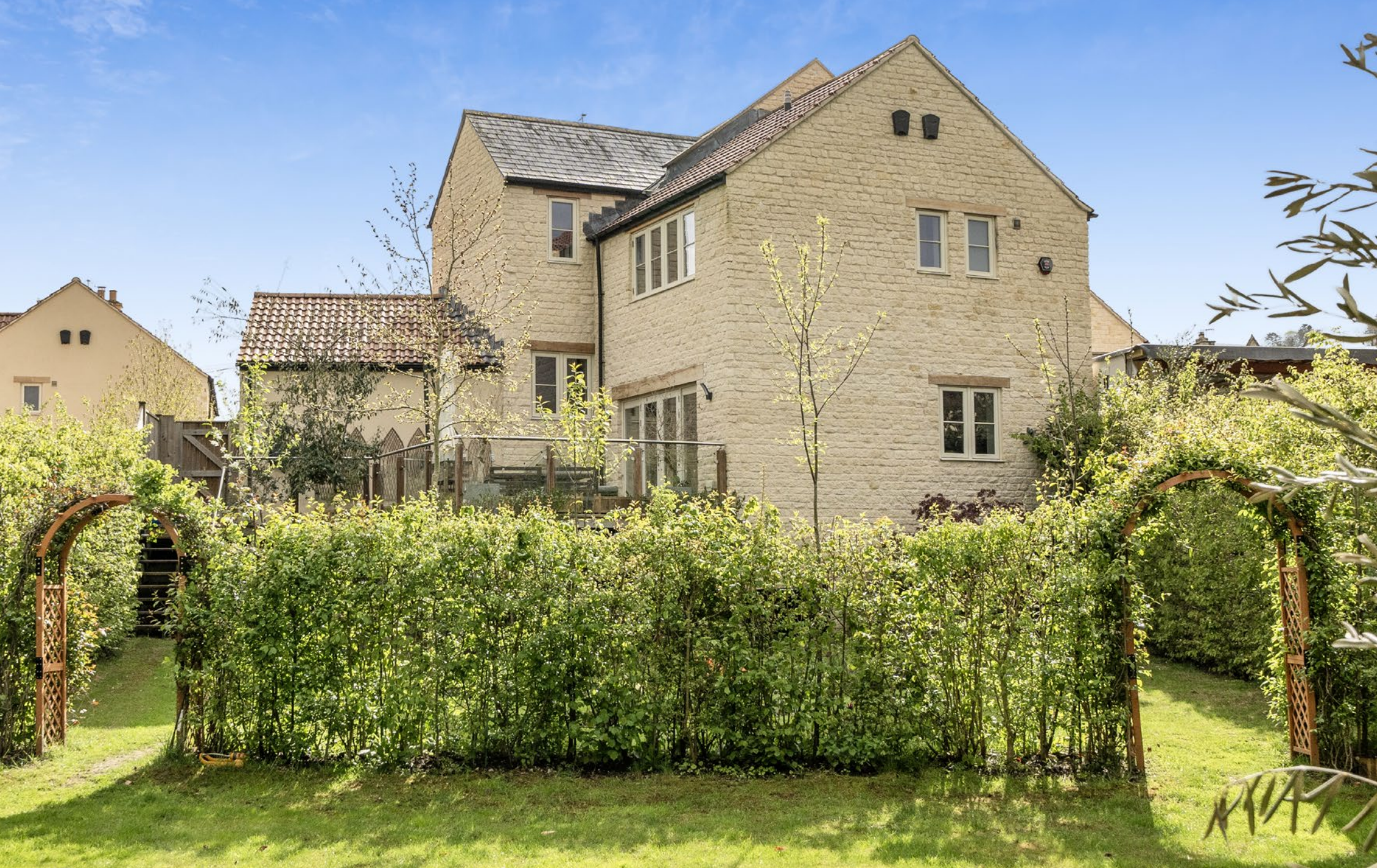
4 HAWKERS YARD Bath