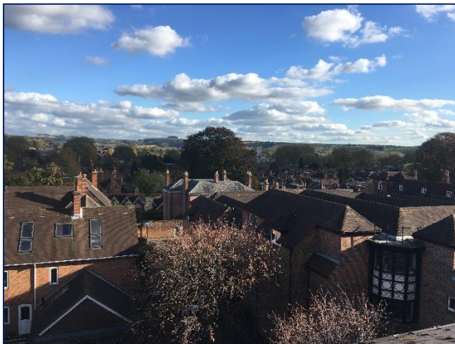
View from the office window

There is the potential for car parking on a short-term basis by way of separate negotiation.