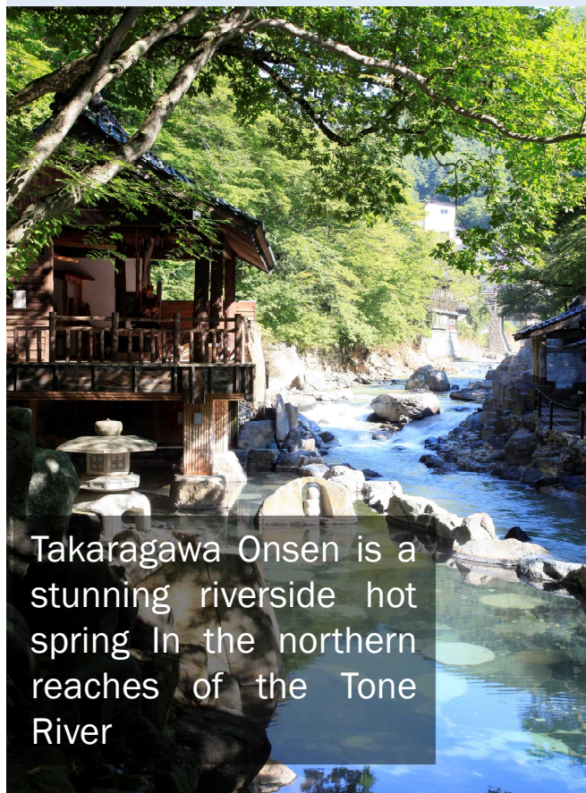
Takaragawa Onsen is a stunning riverside hot spring In the northern reaches of the Tone River