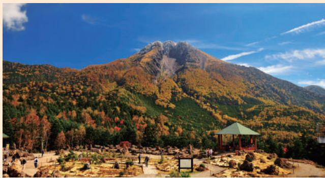
18. Mt. Nikko-Shirane (Katashina)