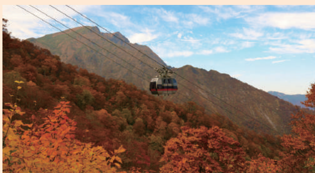
5. Mt. Tanigawa (Minakami)