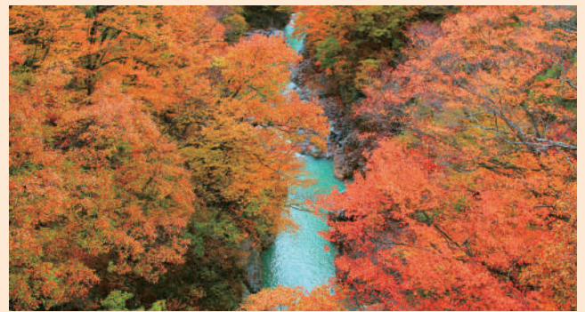
12. Agatsumakyo Gorge (Higashiagatsuma)