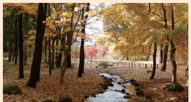
16. Akagi Nature Park (Shibukawa)