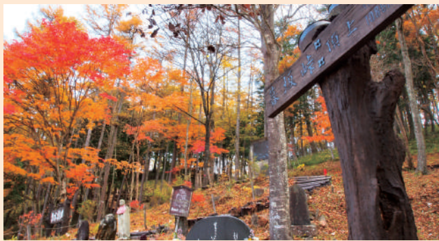
10. Kuresaka Pass (Nakanojo)