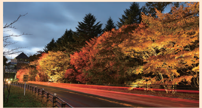
4. Kusatsu Undojaya Park Roadside Station (Kusatsu)