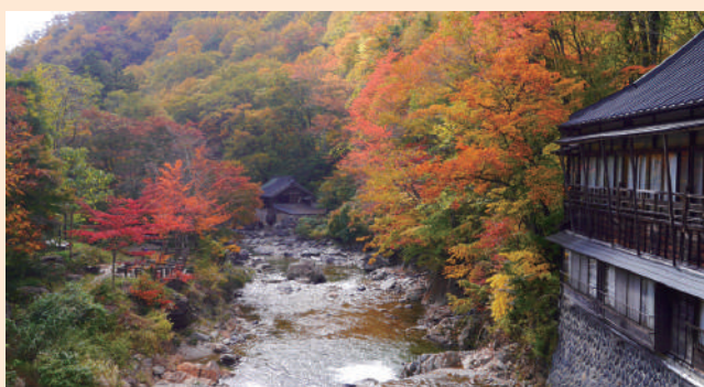
6. Takaragawa Onsen (Minakami)