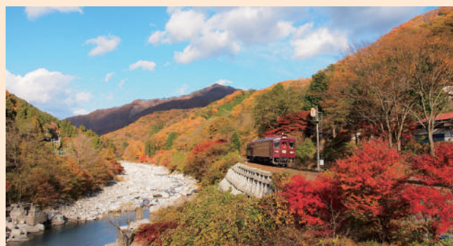
29. Watarase Keikoku Railway (Kiryu, Midori)