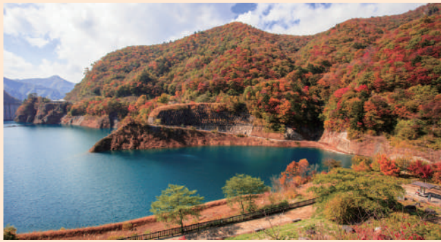
9. Lake Okushima (Nakanojo)