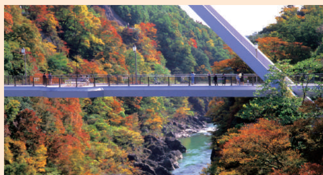
31. Takatsudokyo Gorge (Midori)