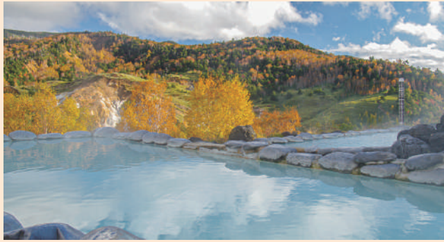
1. Manza Onsen (Tsumagoi)