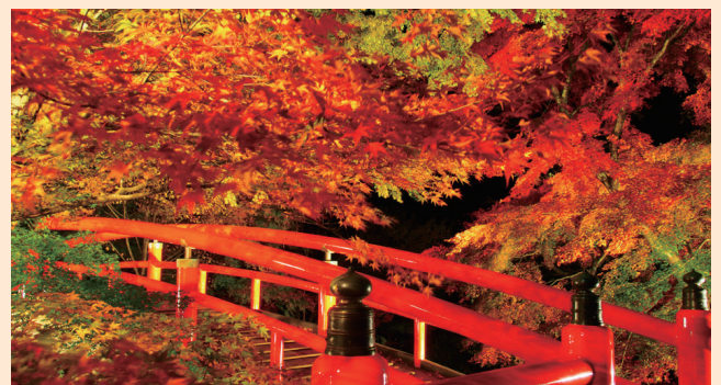
15. Kajika Bridge (Shibukawa)