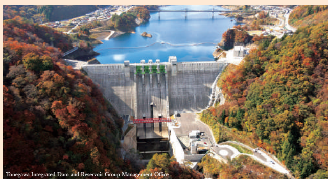
25. Yamba Dam (Naganohara)