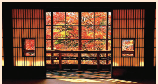
23. Rinkokaku (Maebashi)