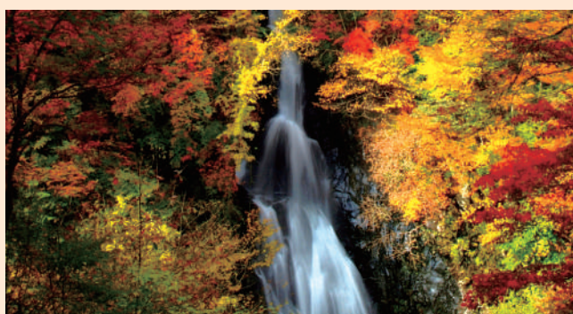
26. Konaka Otaki Waterfall (Midori)