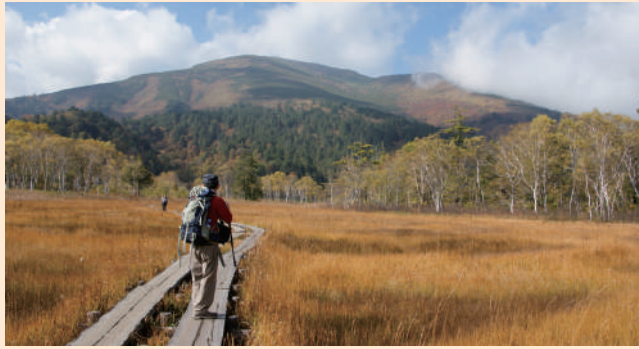
17. Oze National Park (Katashina)