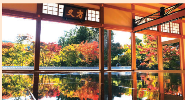
32. Hotokuji Temple (Kiryu)