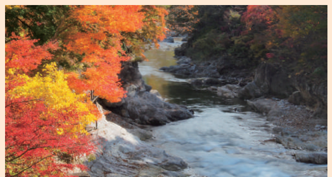
7. Suwakyō Gorge (Minakami)