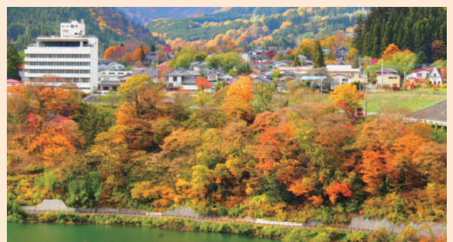
8. Sarugakyo Onsen (Minakami)