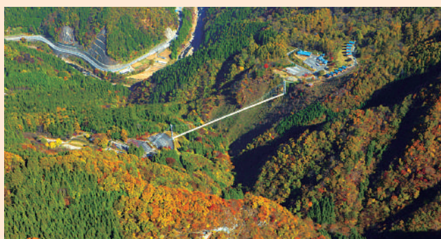
27. Ueno Sky Bridge (Ueno)