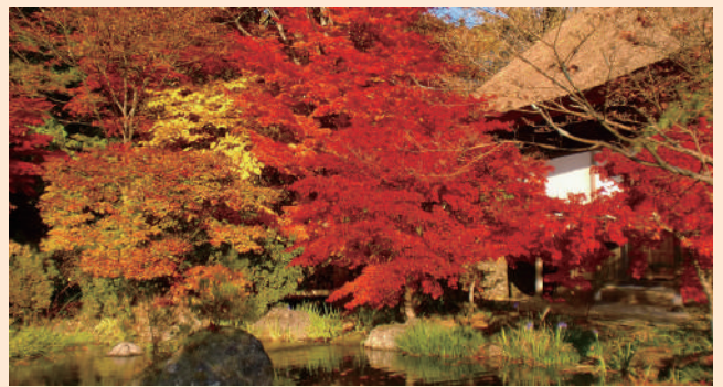
20. Kichijoji Temple (Kawaba)