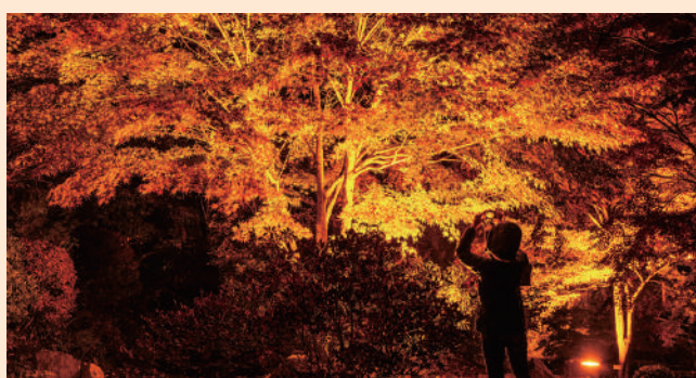
28. Sakurayama Park (Fujioka)