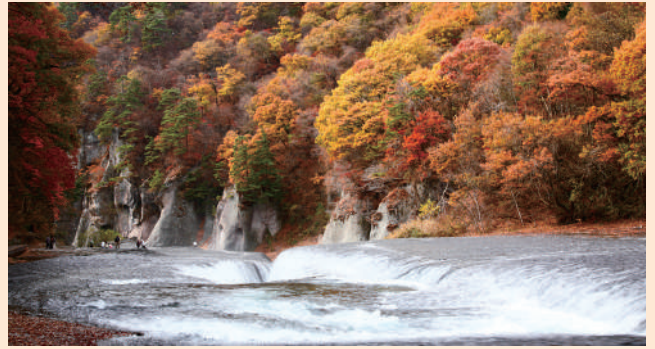
19. Fukiware no Taki Falls (Numata)