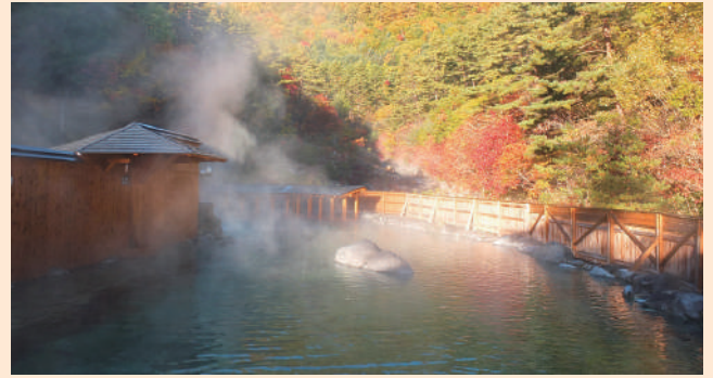
3. Sainokawara Open-Air Bath (Kusatsu)