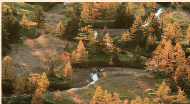
2. Yoshigadaira Wetlands (Kusatsu)