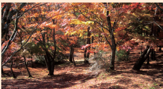
14. Uenoyama Park (Shibukawa)