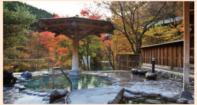
11. Shima Onsen (Nakanojo)