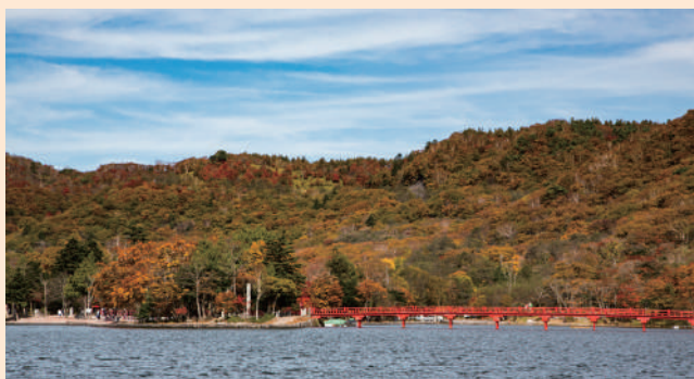
21. Mt. Akagi (Maebashi)