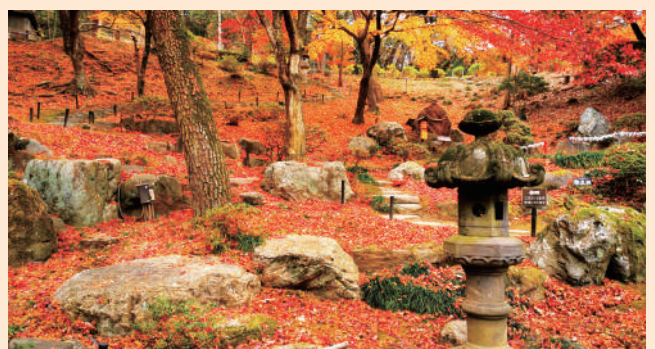
24. Tokumei-en (Takasaki)