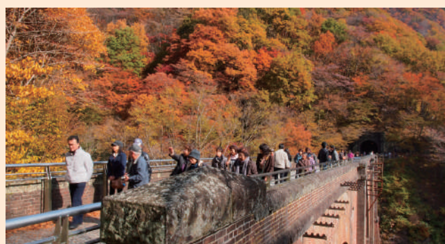
30. Usui 3rd Bridge (Megane-bashi) (Annaka)