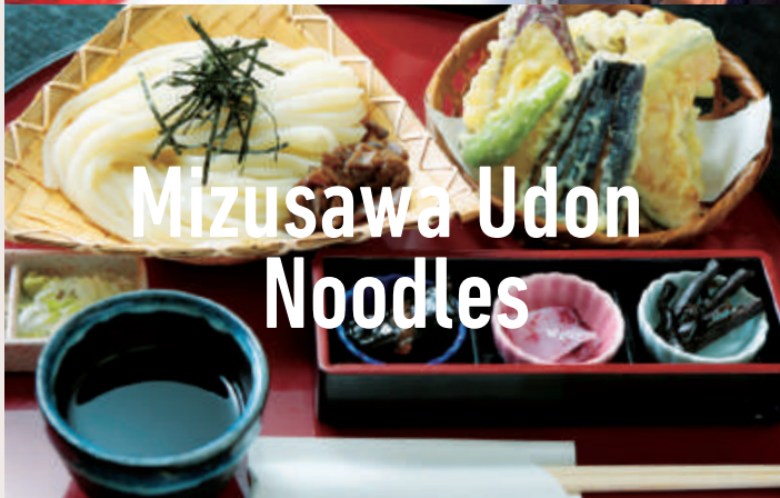
Mizusawa Udon Noodles