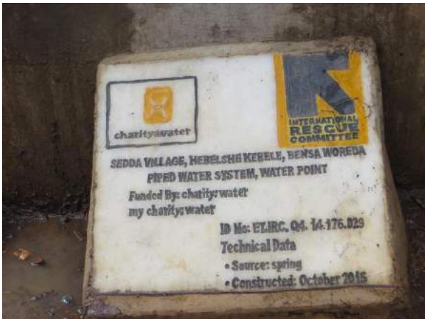
1 PHOTO OF THE WATER POINT IDENTIFICATION