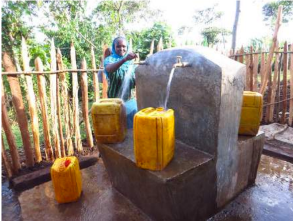
1 PHOTO OF DAILY WATER USERS COLLECTING WATER INTO A CONTAINER