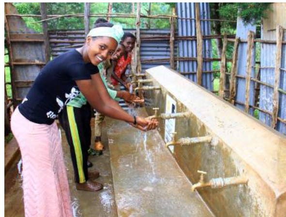
1 PHOTO OF THE HANDWASHING STATIONS