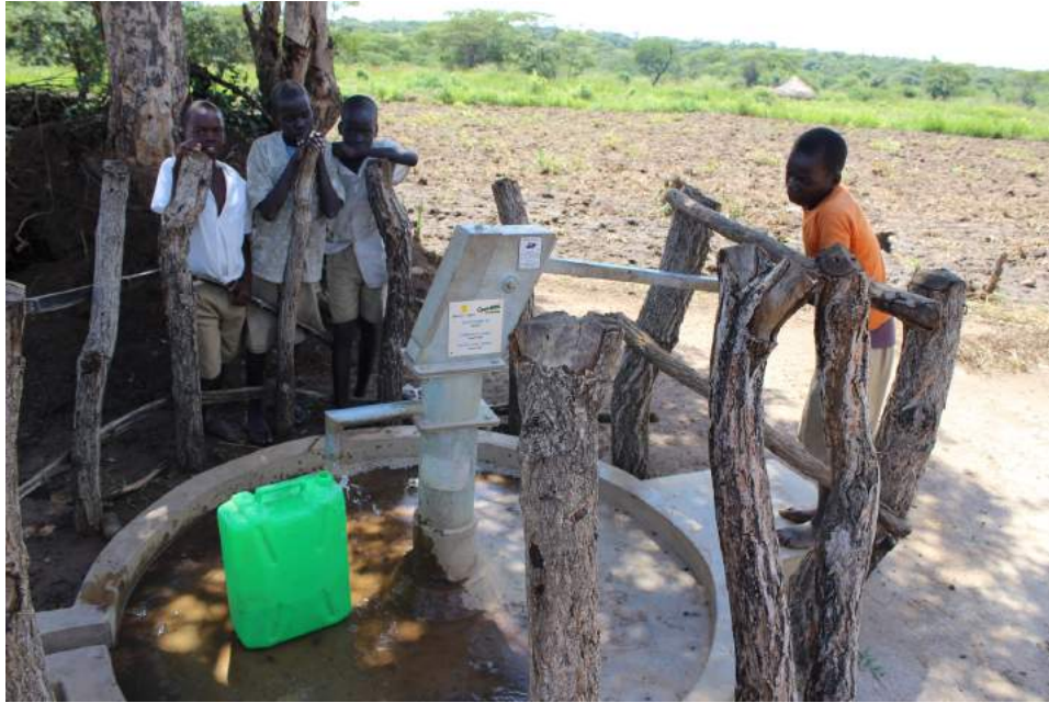
1 PHOTO OF DAILY WATER USERS COLLECTING WATER INTO A CONTAINER NOTE: Water Point Identification is visible & readable