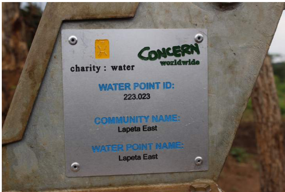
1 PHOTO OF THE WATER POINT IDENTIFICATION NOTE: Background context is included and Water Point Identification text is easily readable.