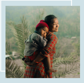
We aim for the longterm sustainability of our water projects

Our partners have a track record of providing scaled, sustainable access to drinking water in rural settings. We work with both international and local NGOs.