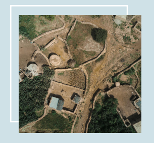
We target areas of high need and low income where we can work in a concentrated geography for multiple years

We expect that our funded projects will function for many years. When communities or local governments have difficulty maintaining functionality, we support post-implementation programs to keep water flowing.