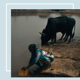
We focus on rural communities

Our partners enhance the health benefits of clean water through community training and behavior change messaging.