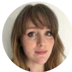
An article by Anna

The moon glows, the trees whisper and the fox moves silently through the grass. This beautiful drawing is created using black paper for the upper part and white paper for the lower part of the artwork. This amazing combination of papers gives your artwork an extraordinary feel and is simple to recreate.