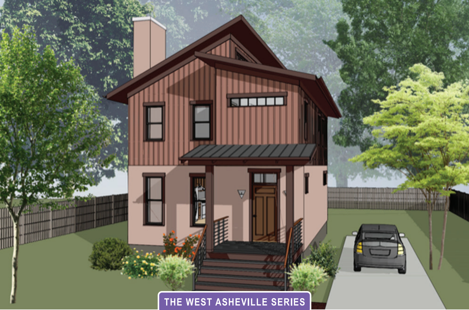
THE WEST ASHEVILLE SERIES