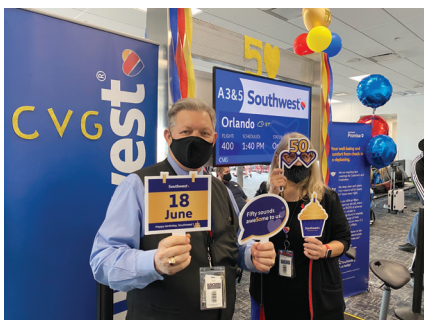
Southwest celebrated their 50th birthday on June 18 th