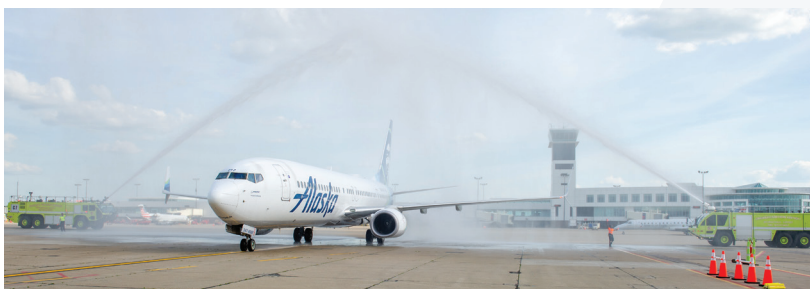
Alaska Airlines' warm welcome for their first flight on May 20 th