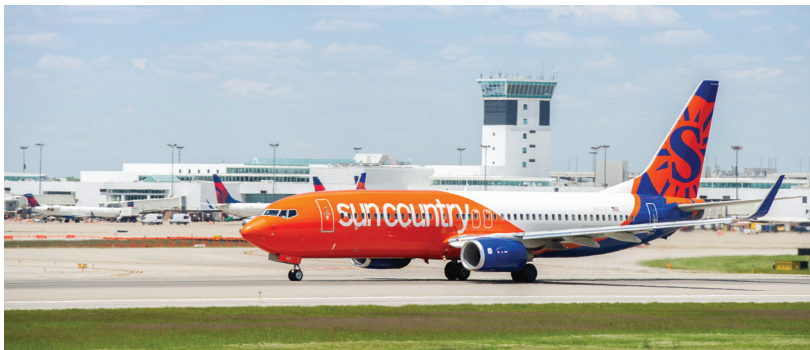
Sun Country's first passenger plane at CVG from Minneapolis on May 14 th

With built-up demand and more airline and route choices at CVG, summer travel is busy and in full swing. CVG celebrated returned routes, new nonstop destinations and new air carriers: Sun Country Airlines and Alaska Airlines.