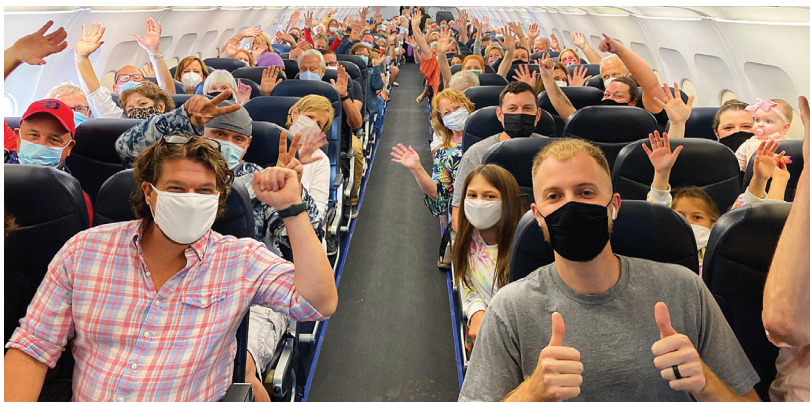
Allegiant's full inaugural flight to Key West on June 9 th