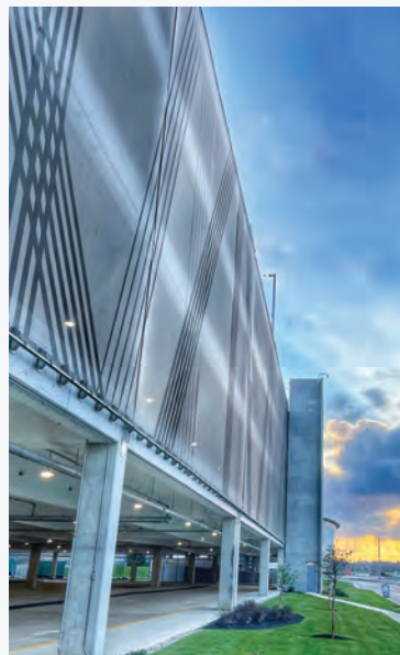
Airside view of CVG Rental Car Facility