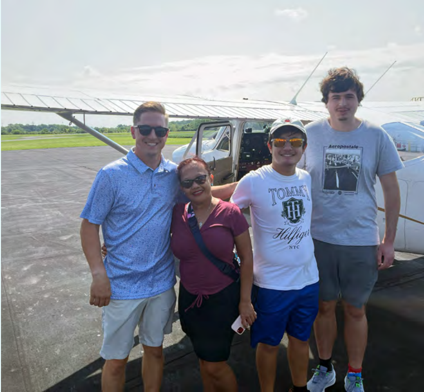
CVG celebrated National Aviation Day with the community at OXD Airport in August.