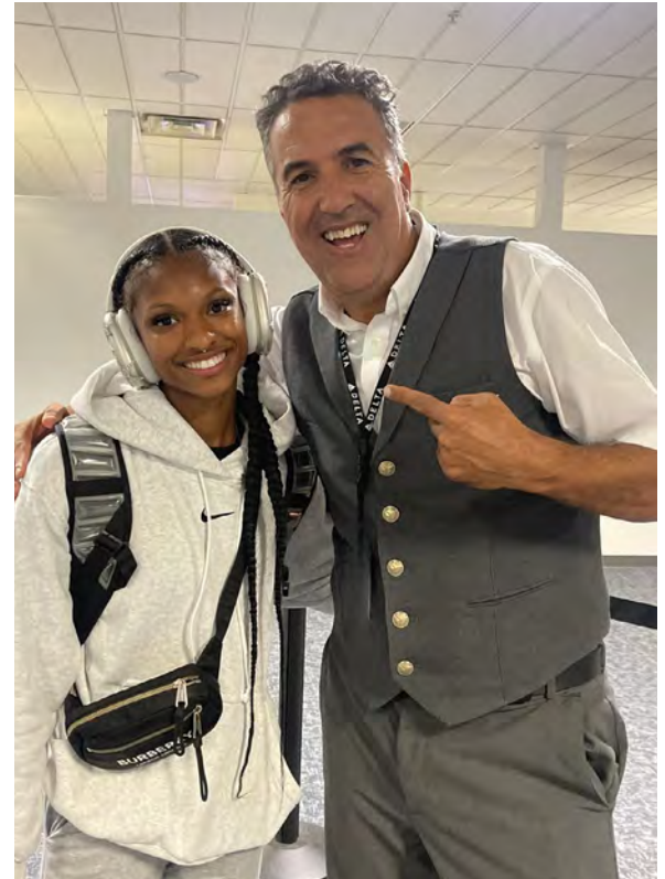
Masai Russell, Olympic gold medalist (100-meter hurdles), and Rose Lavelle, Olympic gold medalist (soccer), traveled through CVG after an outstanding showing at the Paris Olympics.