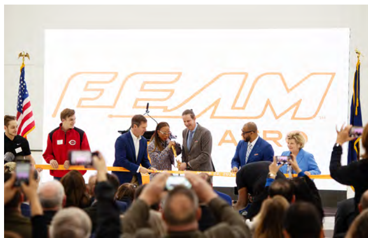
FEAM Aero opened its second hangar, a $45 million investment, in March 2024. The new facility is expected to add 250 new jobs.