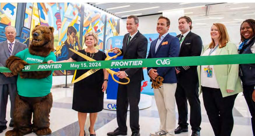
Frontier Airlines opened its crew base at CVG in May. The crew base is expected to generate $27 million annually in local wages.

Cincinnati/Northern Kentucky International Airport