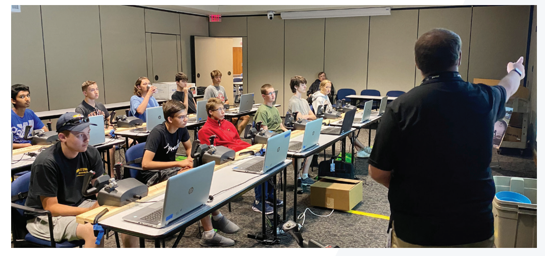
Summer Aviation Camp