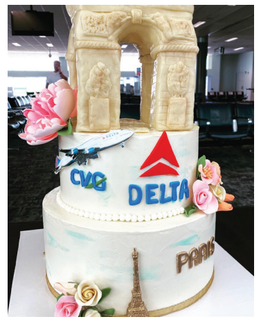
Delta Paris restart