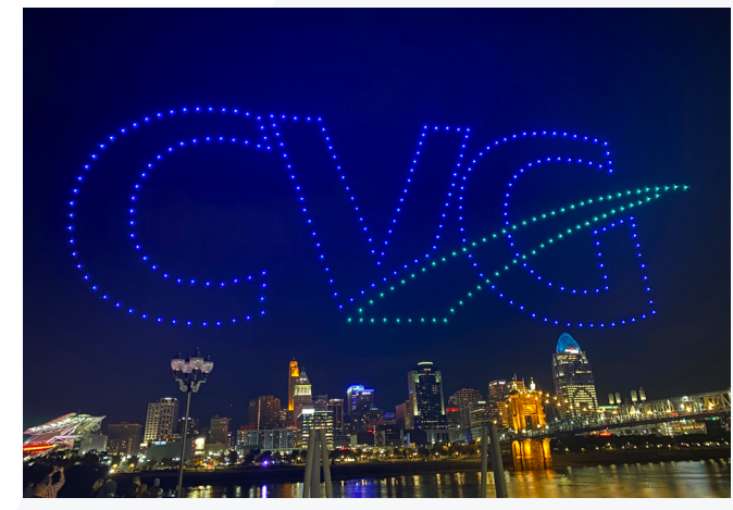
2022 Blink drone show