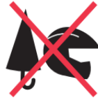
Ομπρέλες / Κράνη Umbrellas / Caskets