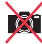
Φωτογραφικές / Βιντεοκάμερες Cameras