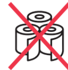
Χαρτοταινίες Paper Rolls