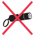
Λείζερ Laser Pointers