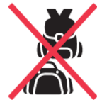
Σακίδια & Τσάντες Bags & Backpacks