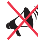
Τηλεβόες Loud Speakers