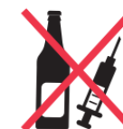
Οινοπνευματώδη & Ναρκωτικά Alcohol & Drugs