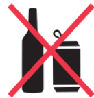
Μπουκάλια Bottles & Cans