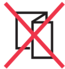
Διαφημιστικά & Έντυπα προπαγάνδας Flyers & Leaflets