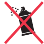
Σπρέι Gas Canister