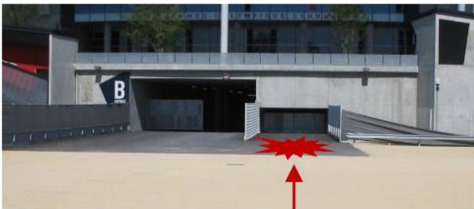
Away fans' entrance & control/searching zone