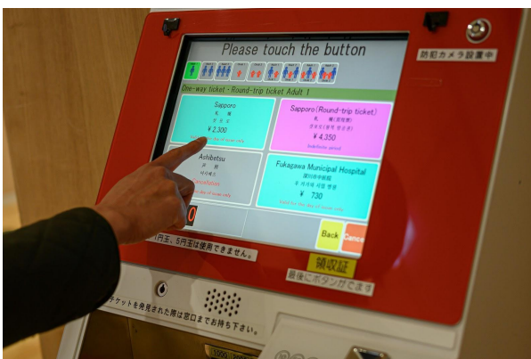
An multilingual ticket machine at Asahikawa Station Bus Terminal

Some of these bus counters will have multilingual ticket machines. If so, this is the easiest and fastest way to make a reservation! Simply select your language, select the journey you need, the number of people and then pay the fare required.