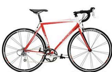
Road TREK 1.2 Frame sizes available from 43 to 60 cm