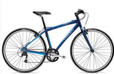
Hybrid TREK FX 7.4 Frame sizes available from 15 to 22.5 inch

You're welcome to bring your own bike if you wish, and we will take care of storing the bike case or box for you while you're on the tour. Please note that the tour cost will not be discounted for bringing your own bike.