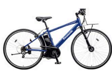
E-bike Panasonic Jetter Frame sizes available from 15 to 20 inch