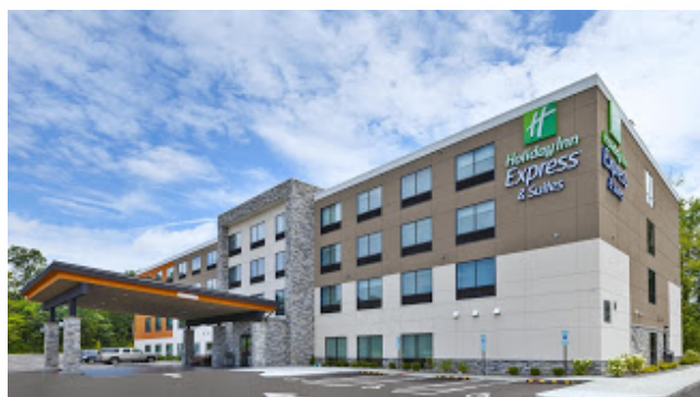
Holiday Inn Express and Suites Center 11200 Gold Court, Painesville, Ohio 44077 440-898-0900