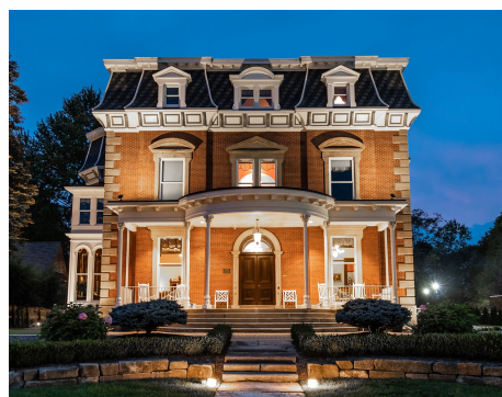
Steele Mansion Inn & Gathering Hub 348 Mentor Avenue, Painesville, Ohio 44077 (440) 639-7948 www.steelemansion.com