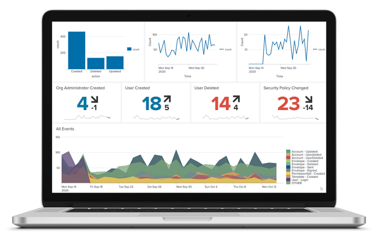
Monitor can integrate directly with your existing security stack (shown here in Splunk).